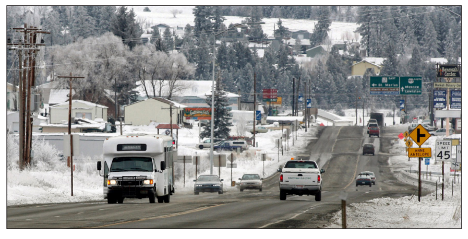
Rural transits systems face unique challenges in maintaining a compliant random testing program.

Since the goal of the random program is both detection and deterrence of drug use and alcohol misuse, each employee should have a reasonable expectation that they may be selected for random testing anytime they are performing safety-sensitive duties. Randomizing (or strategically altering) your random testing rate each selection period may be an effective way of drastically improving your random testing program.