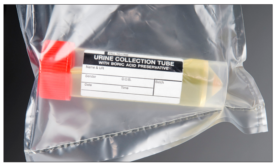
Knowing who does what in the collection process will help avoid problems.

When the HHS-certified labora tory receives urine specimens with their corresponding CCF, laboratory personnel check to see if the specimen ID number