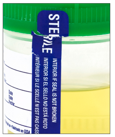
These changes will help drug and alcohol programs improve efficiency and effectiveness.

Thorough training for reasonable suspicion evaluations and determinations will provide your transit system with a